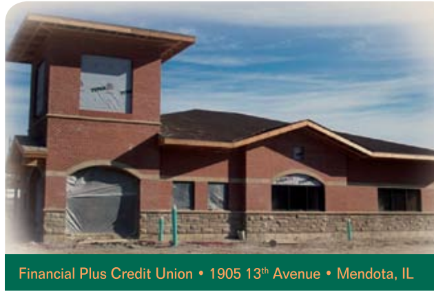
Financial Plus Credit Union • 1905 13 th Avenue • Mendota, IL

Financial Plus Credit Union's new full service 3,857 square foot facility is located at 1905 13 th Avenue across from the Mendota Civic Center. It features three drive-up lanes, a 24 hour ATM, Safe Deposit boxes, and plenty of free parking. 2672